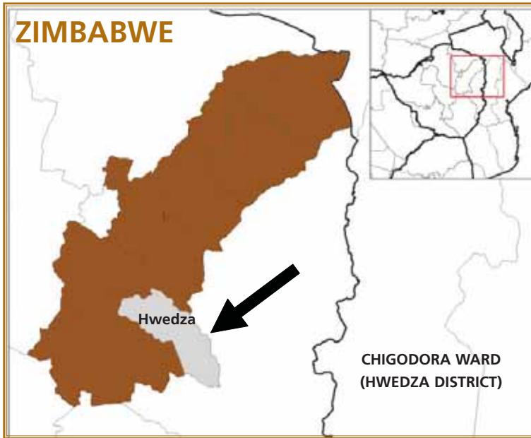
Figure 1 - Research Areas

SWEETPOTATO MICROPROPAGATION PROJECT SITE