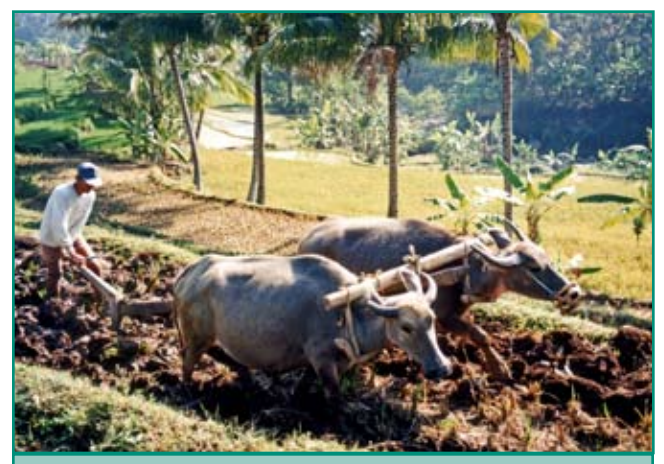
Lack of fuel and energy is a significant constraint on agricultural productivity in the two regions.