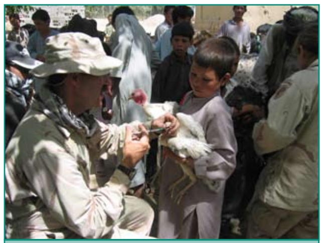
A veterinarian vaccinates a chicken in Afghanistan.

Disease-suppressive soils: The use of disease-suppressive soils involves management practices that encourage crop-associated microbial communities that naturally reduce plant diseases and pests. These practices might include manipulating carbon inputs, using crop rotation sequences that increase the presence of beneficial organisms, or inoculating the soil with disease-suppressive microorganisms.