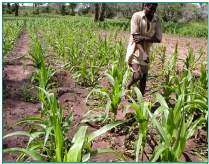
A Zambian farmer stands with his maize crop, severely stunted by drought. Integrated water management could help farmers deal with water shortages.

directly to plants' root zones, is the most efficient form of irrigation technology, but it is currently expensive.